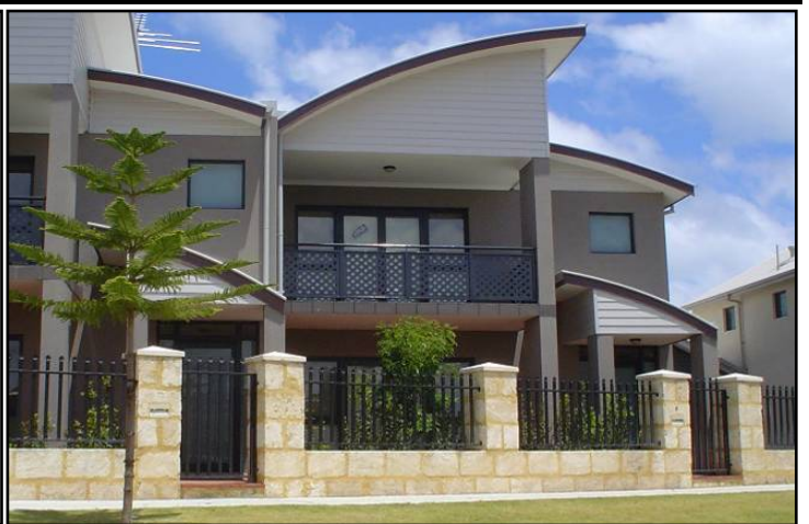
QuarriedStone 500 Piers, Walls & Capping