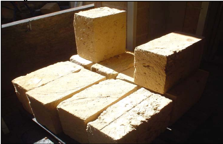
'Ready to Lay' - QuarriedStone SOM240 Blocks