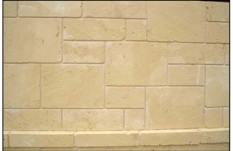
Diamond Cut '2 - Part' QuarriedStone Cladding