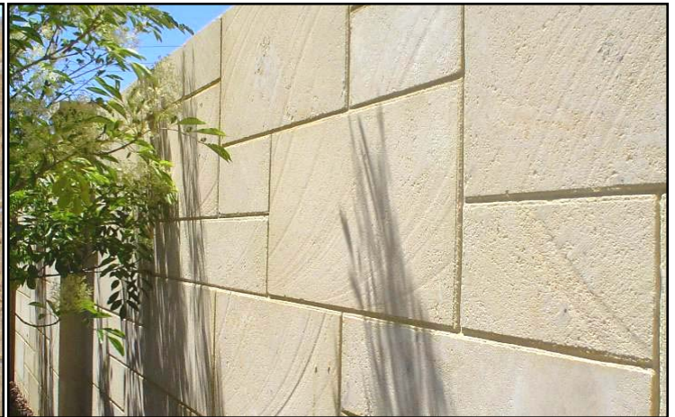
QuarriedStone 'Diamond Cut' Random Pattern Perimeter Wall

SomerStone QuarriedStone offers true versatility for any landscape project. Available in a range of products including retaining wall systems, cladding, stone piers and wall capping, SomerStone can help achieve continuity in landscape design through use of a range of products, tying the landscape project together. SomerStone offer a range of pre-cast paving, pool coping and wall capping that also compliments the natural QuarriedStone range.