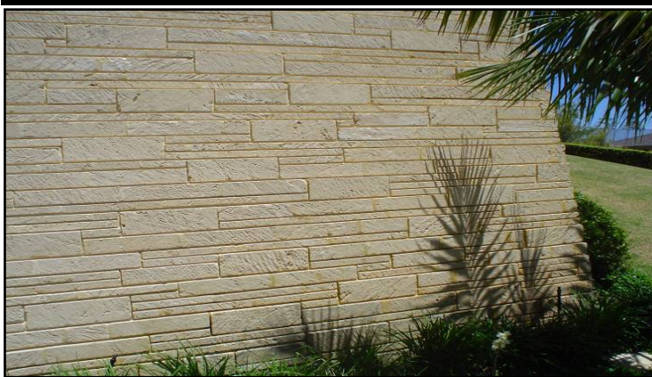
'Saw Cut ' QuarriedStone Cladding