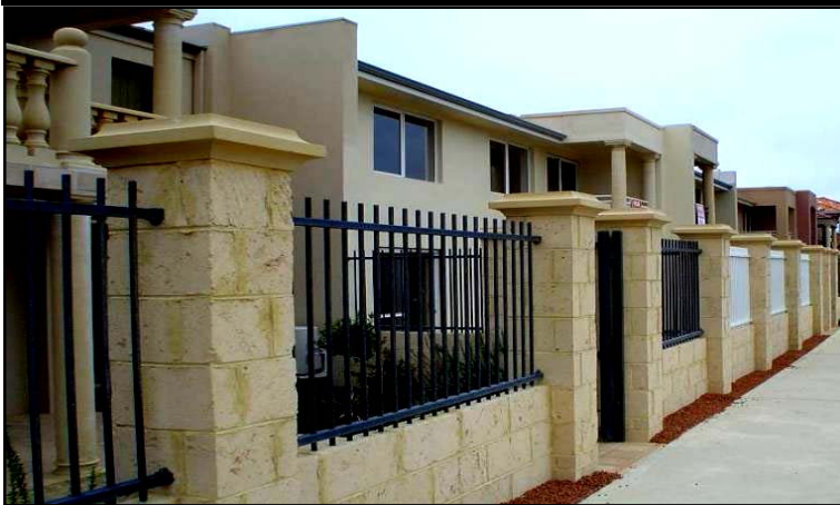
QuarriedStone 350 Piers with Capping