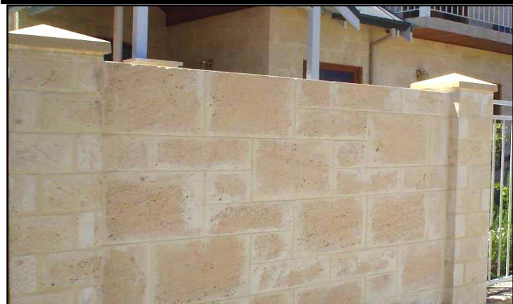
Diamond Cut 'Random Ashlar' QuarriedStone