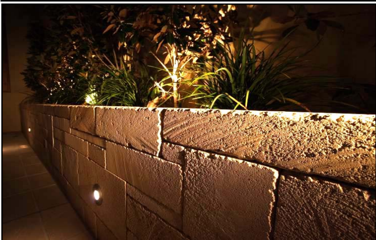
'Saw Cut ' QuarriedStone Cladding