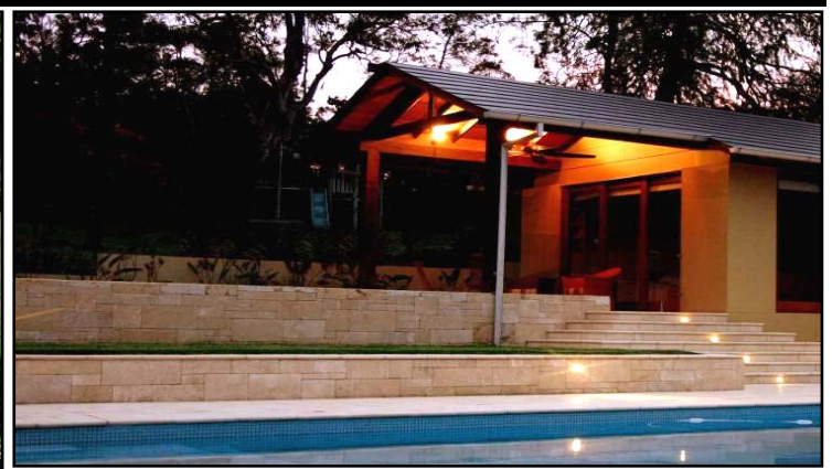
QuarriedStone 'Bush Hammered' Cladding