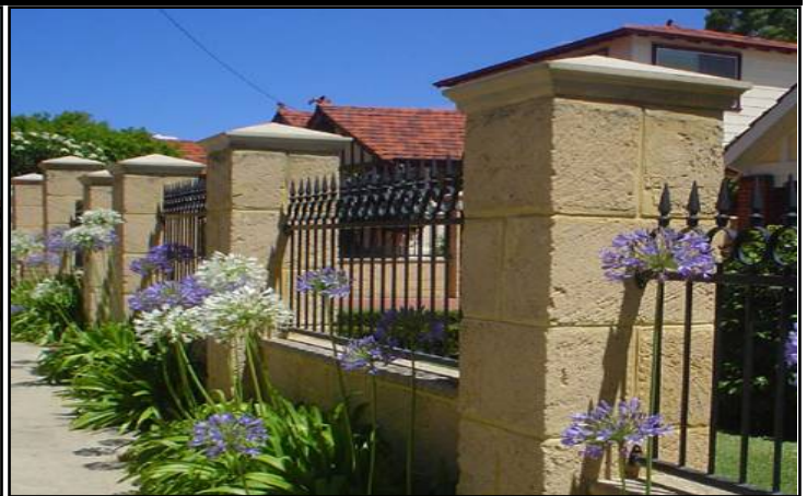
QuarriedStone 500 Piers with Capping