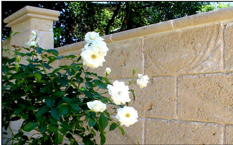
QuarriedStone 'Saw Cut' Landscape Blocks & Capping

SomerStone QuarriedStone is a soft coloured natural stone quarried locally in Australia. Exclusive to SomerStone, this unique offering is available in a smooth, 'Diamond Cut' finish suitable for achieving contemporary design or available in a more textured and rustic, 'Saw Cut' finish which is used more frequently in classic designs.