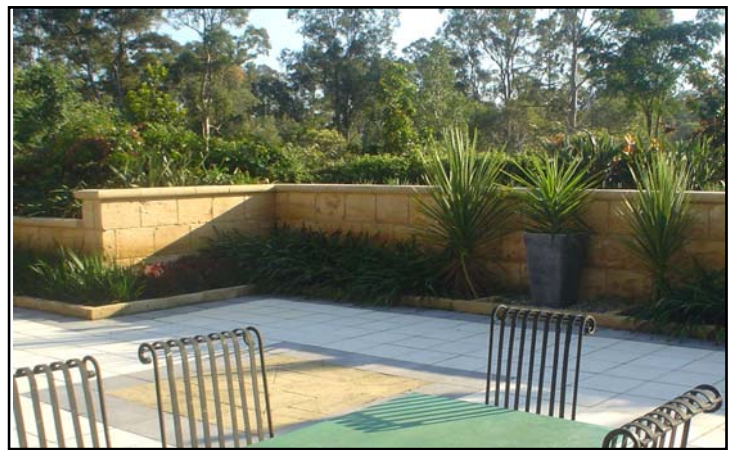
QuarriedStone Landscape Blocks & Capping - Entry Features