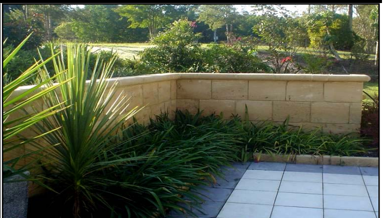
QuarriedStone SOM240 Retaining Wall