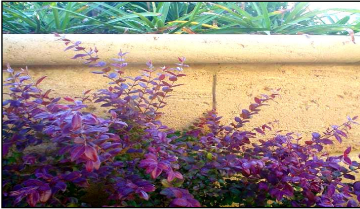
QuarriedStone SOMSB240 Single Bullnose