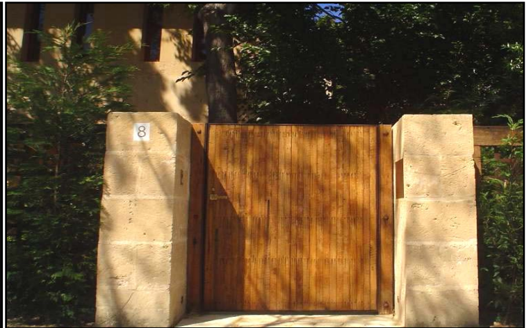
Entry Piers - QuarriedStone 240 wide Blocks