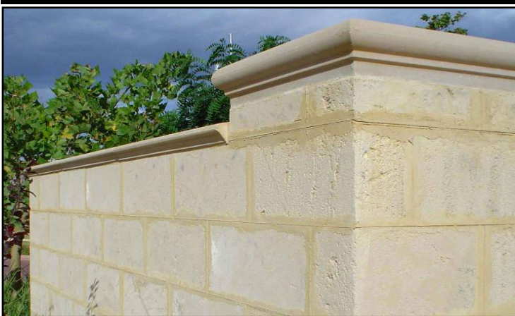
Diamond Cut SOM200 QuarriedStone with Capping