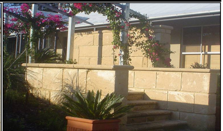
'Saw Cut' QuarriedStone & Bullnose Capping