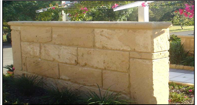
QuarriedStone SOMDB320 Double Bullnose