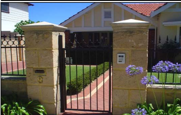
QuarriedStone Entry Piers, Walls & Capping