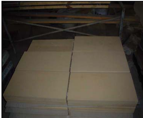
600 x 300 x 40 Copings