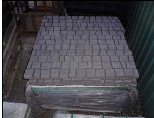
1400 x 400 x 40 Cobblestones Mats

Please phone SommerStone on (07) 3266 1411 for more information.