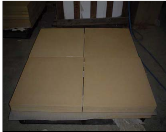
600 x 600 x 40 Pavers